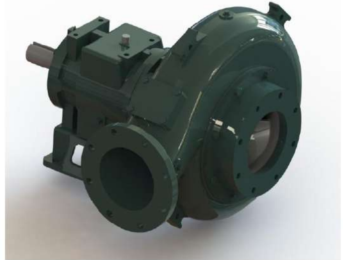
A typical picture of the pump is shown. Please contact StarTechPump Company for further details. All information is approximate and for general guidance only.