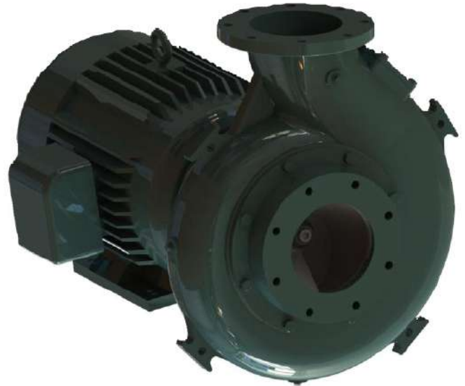
A typical picture of the pump is shown. Please contact StarTech Pump Company for further details. All information is approximate and for general guidance only.