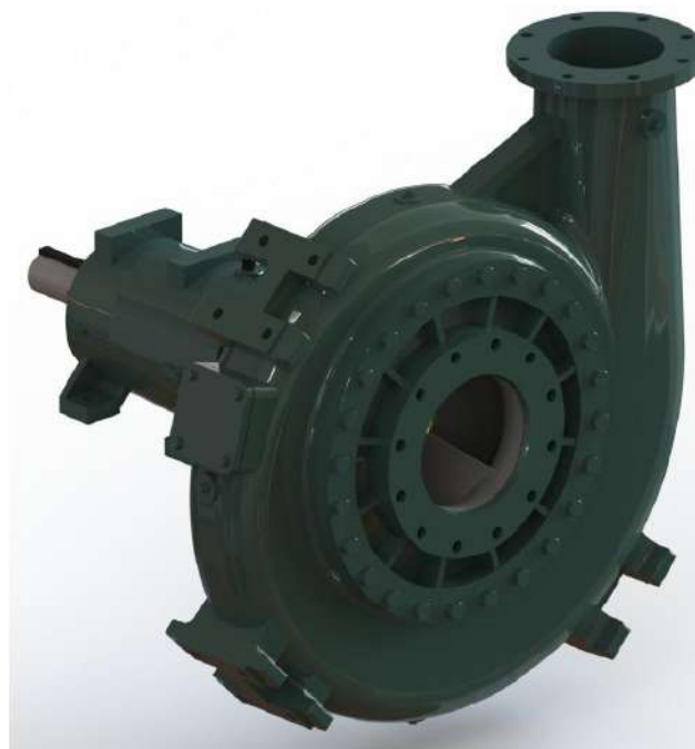
A typical picture of the pump is shown. Please contact StarTech Pump Company for further details. All information is approximate and for general guidance only.