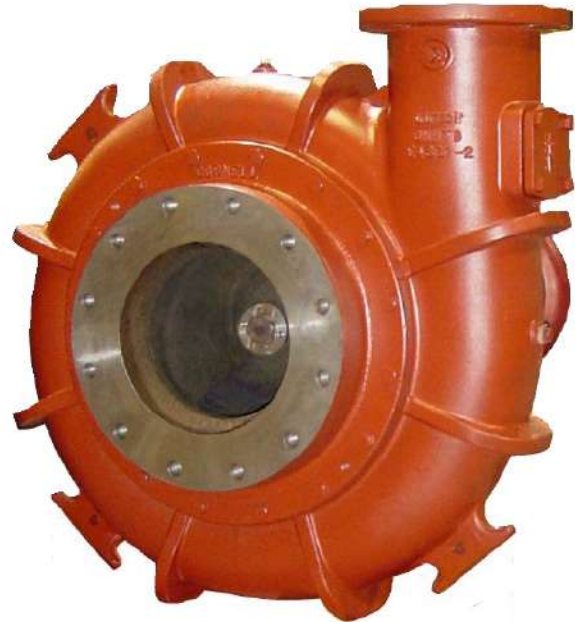
A typical picture of the pump is shown. Please contact StarTech Pump Company for further details. All information is approximate and for general guidance only.