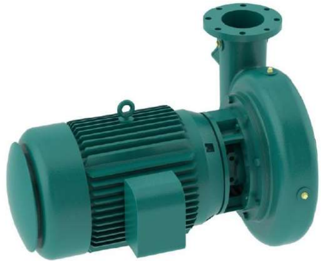
A typical picture of the pump is shown. Please contact StarTech Pump Company for further details. All information is approximate and for general guidance only.