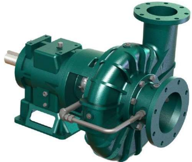
A typical picture of the pump is shown. Please contact StarTech Pump Company for further details. All information is approximate and for general guidance only.