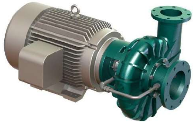
A typical picture of the pump is shown. Please contact StarTech Pump Company for further details. All information is approximate and for general guidance only.