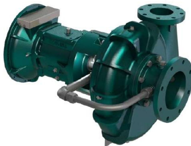
Atypical picture of the pumps shown. Please contact StarTech Pump Company for further details. All information is approximate and for general guidance only.