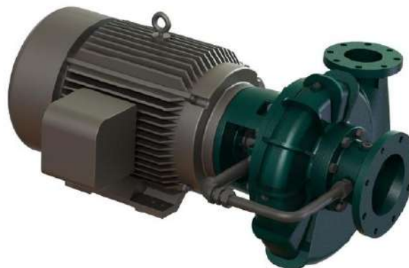
A typical picture of the pump is shown. Please contact StarTech Pump Company for further details. All information is approximate and for general guidance only.