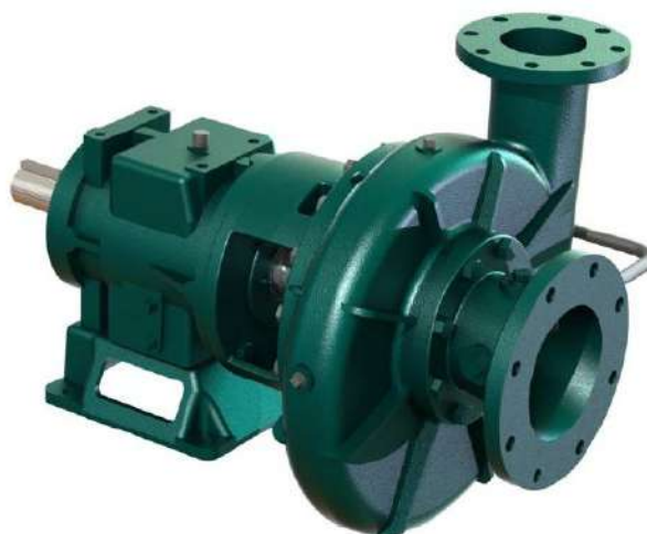
A typical picture of the pump is shown. Please contact StarTech Pump Company for further details. All information is approximate and for general guidance only.