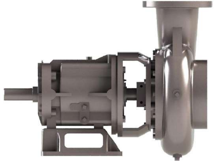
A typical picture of the pump is shown. Please contact StarTech Pump Company for further details. All information is approximate and for general guidance only.

The 4NNT pump is designed with StarTech's renowned quality and durability. It features a 4" discharge, 4" suction, and enclosed impeller. StarTech's patented Cycloseal® design is standard, with a Type 1 or 2 single mechanical seal with Buna-N elastomers, stainless steel hardware and tungsten carbide vs. silicon carbide seal faces for abrasion resistance.