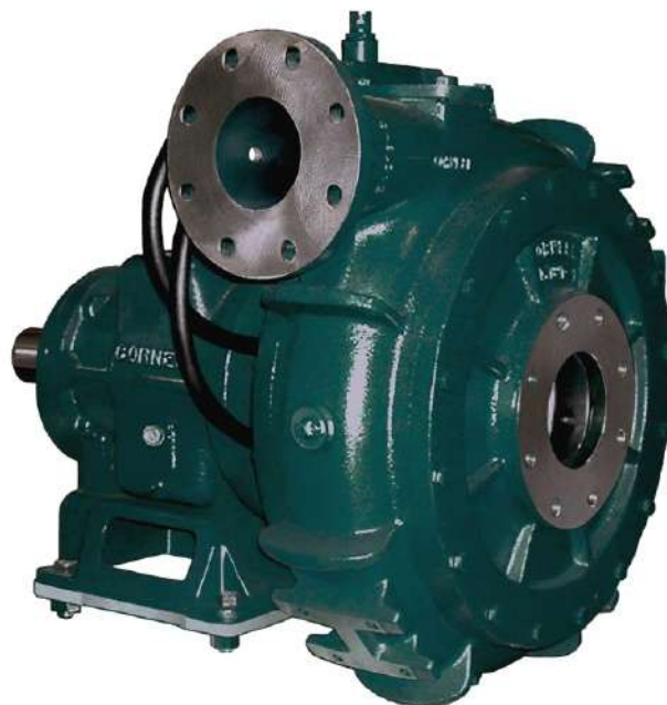
A typical picture of the pump is shown. Please contact StarTech Pump Company for further details. All information is approximate and for general guidance only.