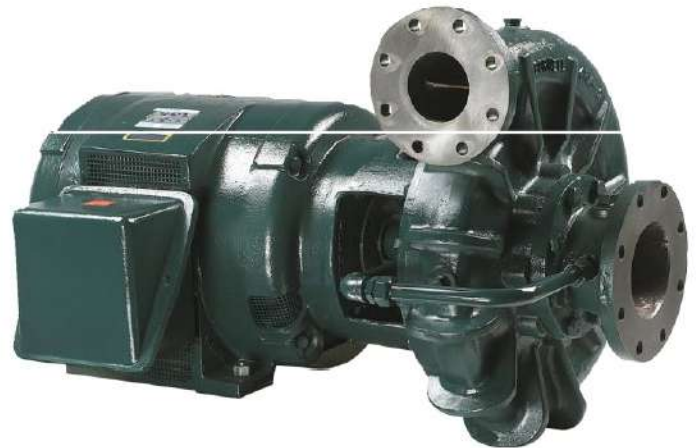
A typical picture of the pump is shown. Please contact StarTech Pump Company for further details. All information is approximate and for general guidance only.