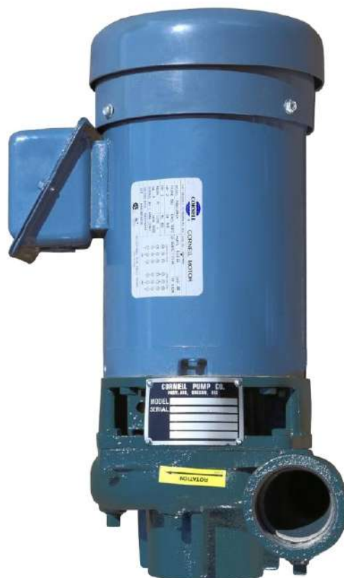
A typical picture of the pump is shown. Please contact StarTech Pump Company for further details. All information is approximate and for general guidance only.

The 2C Edge End Gun Booster pump is designed with StarTech's renowned quality and durability. It features a 2" discharge, 2.5" suction, and enclosed impeller. StarTech's patented Cycloseal® design is standard.