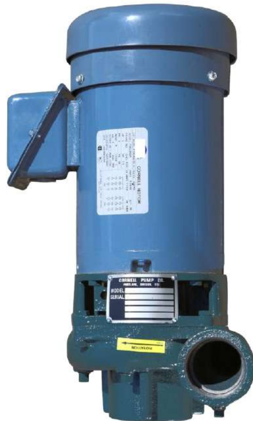
A typical picture of the pump is shown. Please contact StarTechPump Company for further details. All information is approximate and for general guidance only.

The 2B Edge End Gun Booster pump is designed with StarTech's renowned quality and durability. It features a 2" discharge, 2.5" suction, and enclosed impeller. StarTech's patented Cycloseal® design is standard.